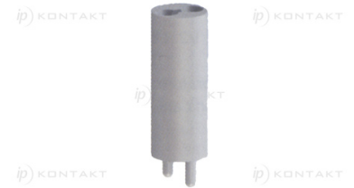
Otwory montażowe Mounting holes