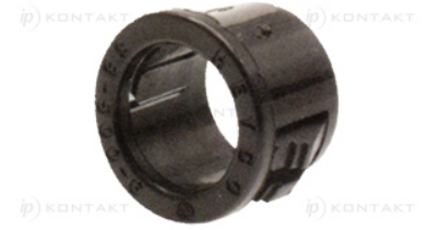
Typ 2 - wiele paneli Type 2 - multiple panel design